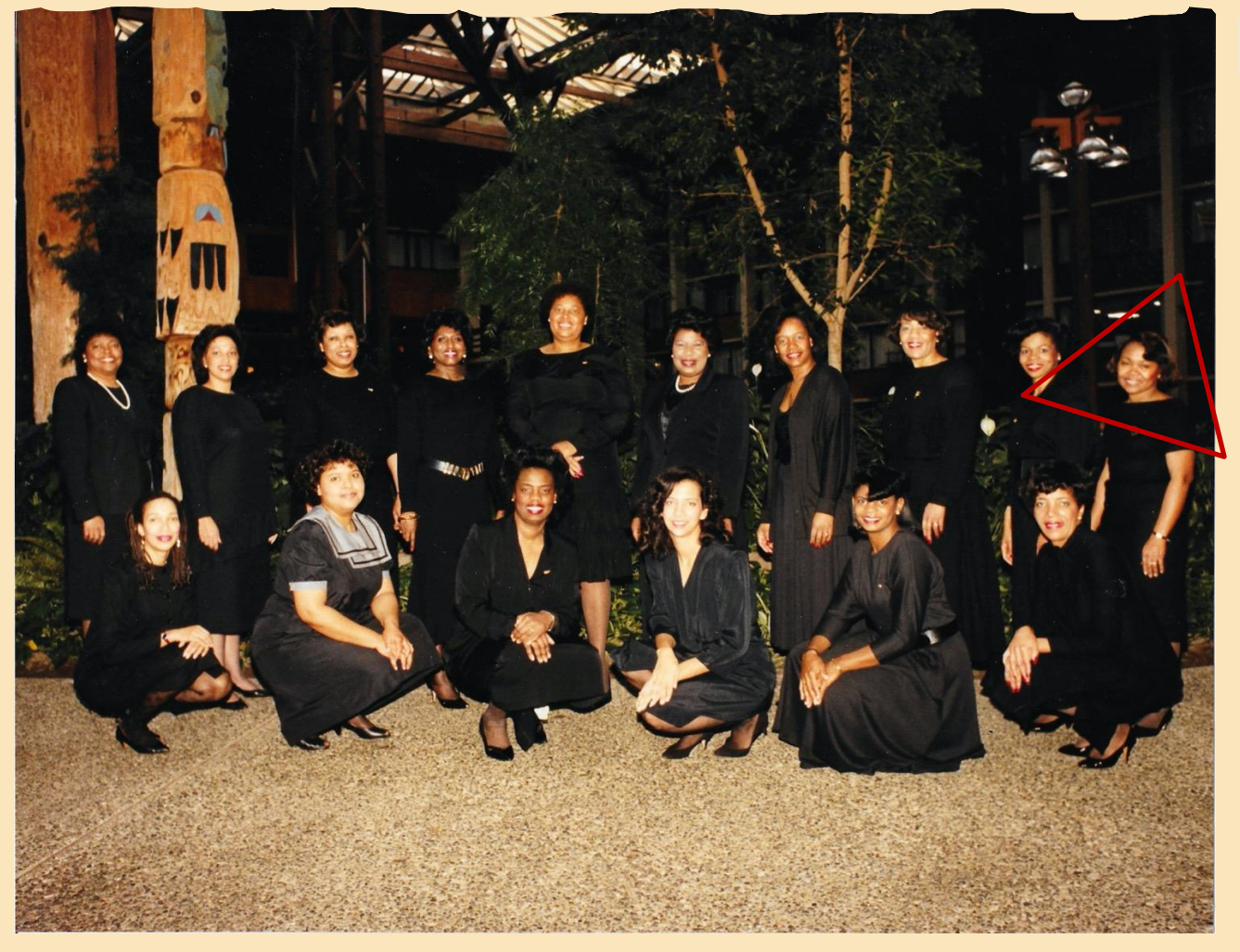
Charter members of Bellevue Alumnae's chapter of Delta Sigma Theta, Bellevue, WA circa.1989