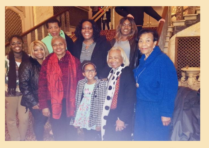
Bellevue Alumnae attending a play for a Sisterhood event Winter 2018.

For those of us who have a thirty-year history with our chapter there exists a special love and allegiance. The chapter is our baby and we feel a powerful need to keep it going even as we age and suffer the other ravages of life. With sorors aging, Bellevue for the past three years has operated as a skeleton crew. After our hosting Founders Day in 2018 the officers were wiped. They had been a small cadre